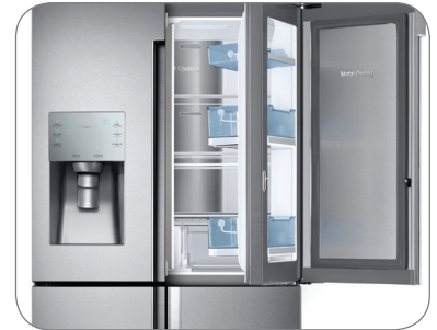
Food Showcase Door with Metal Cooling