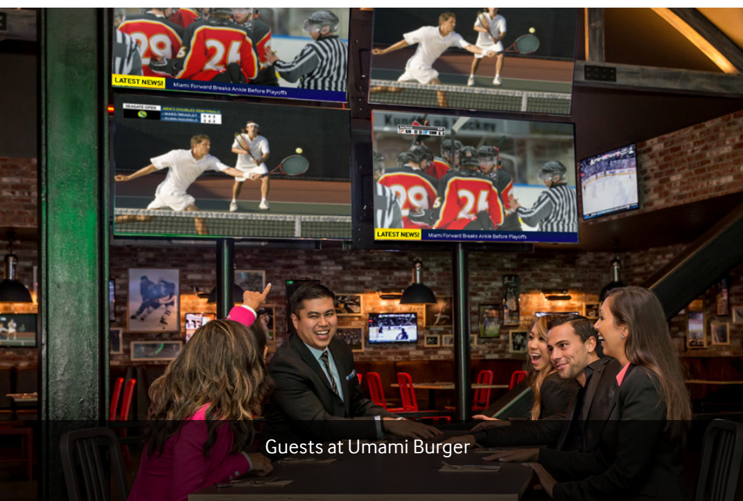
Guests at Umami Burger