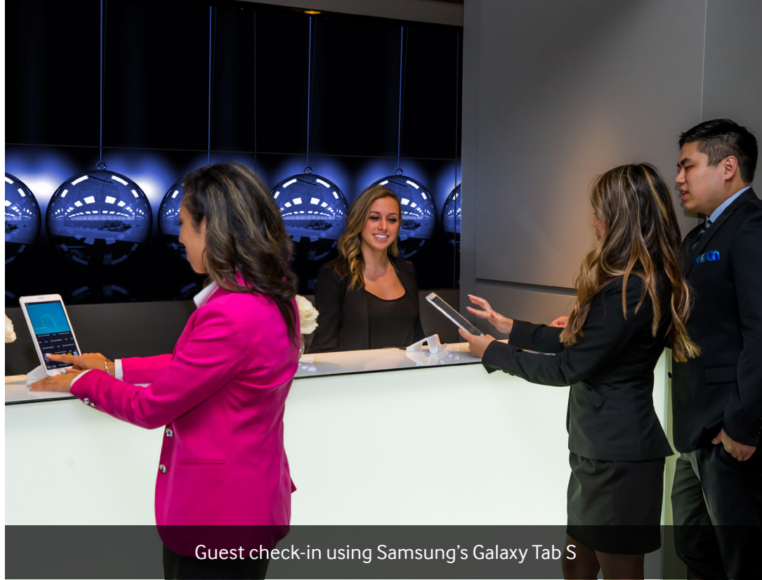
Guest check-in using Samsung's Galaxy Tab S