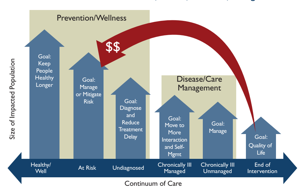
Figure 1: From Acute Care to Prevention - Track, Predict, Intervene, Manage

Thus the focus at all levels—government, insurers, healthcare providers, employers and individuals—is on better management of chronic conditions, as well as preventive care efforts to reduce the likely impact of chronic diseases in the future. With this focus comes a shift in investment toward preemptive actions that assist with awareness, fitness, and early diagnosis of at-risk individuals, as shown in Figure 1.