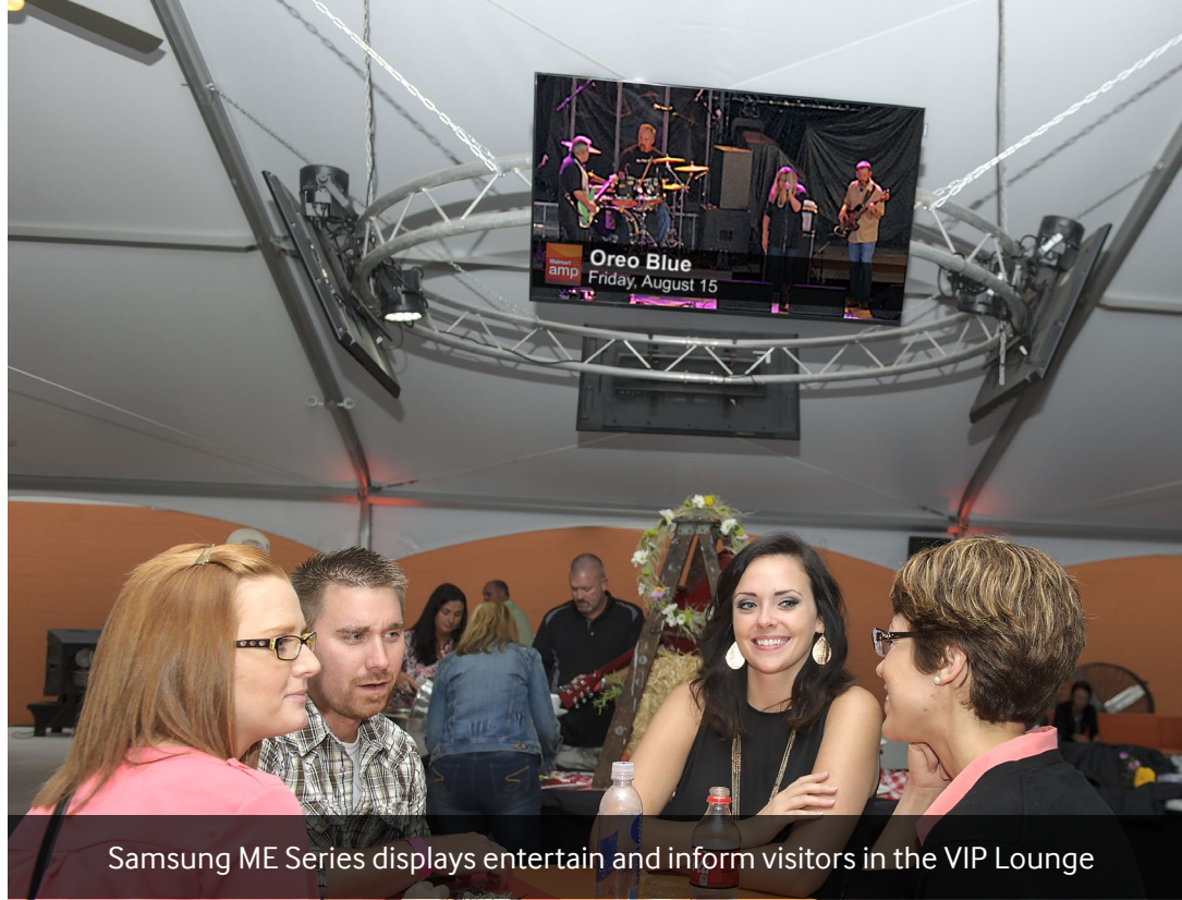
Samsung ME Series displays entertain and inform visitors in the VIP Lounge

General Manager of Operations and Programming