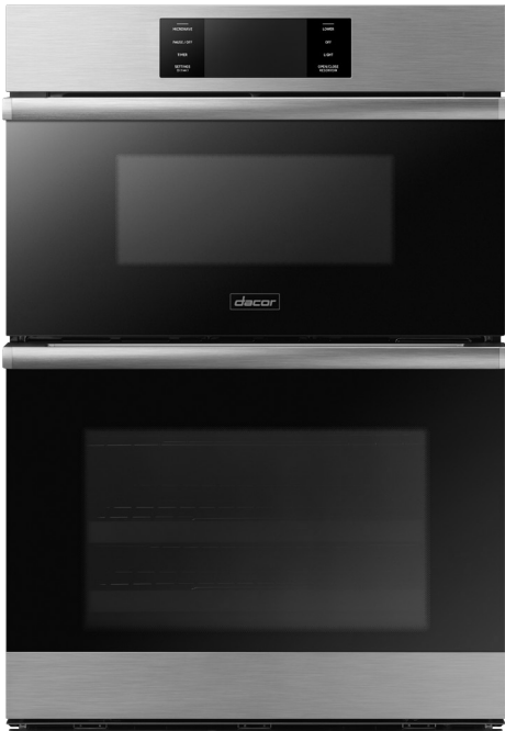
DOC30M977DS/DA - Silver Stainless $7,999 DOC30M977DM/DA - Graphite Stainless $8,699