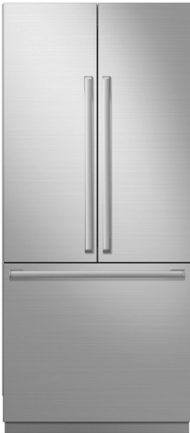
DRF365300AP/DA - Panel Ready