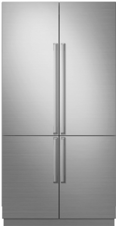
DRF425300AP/DA - Panel Ready