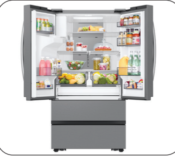
Large 30 cu. ft. Capacity