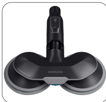
Spray Spinning Sweeper