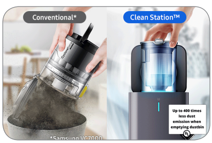
Anti-Dust Emitting Structure