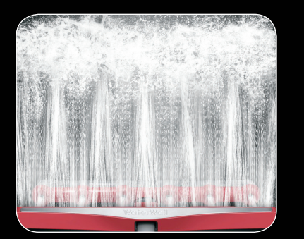
WaterWall<sup>™</sup> Linear Wash System

WaterWall<sup>™</sup> cleaning system delivers corner to corner coverage, so that even your dirtiest will come clean