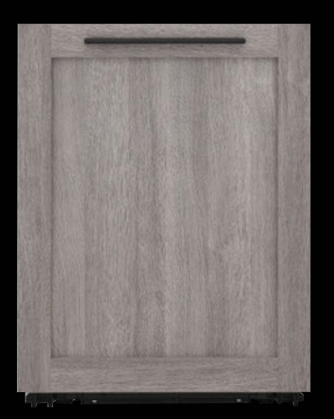
Custom panel and handle not included.

Panel ready design, seamlessly blends in with existing cabinetry.