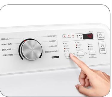
8 Preset Drying Cycles