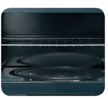
Ceramic Enamel Interior