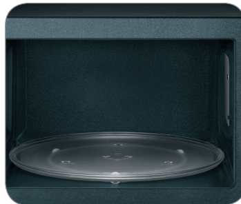
Ceramic Enamel Interior