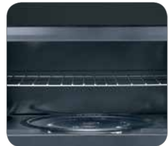
Ceramic Enamel Interior