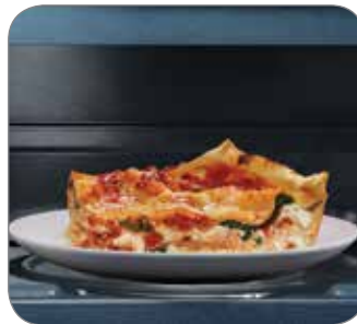
Smart Multi Sensor