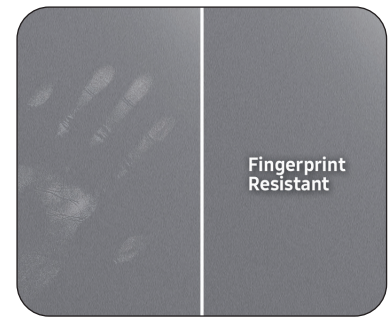
Fingerprint Resistant Finish