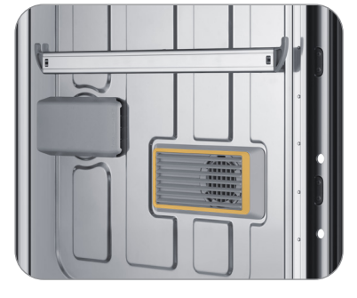
Smart Dry with AutoRelease<sup>™</sup> Door

Fingerprint Resistant Black Stainless Steel