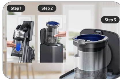
Auto Empty Dust Bin