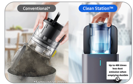
Anti-Dust Emitting Structure