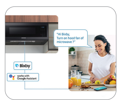
Wi-Fi and Voice Control

Fingerprint Resistant Black Stainless Steel