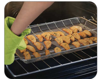
No Preheat Air Fry