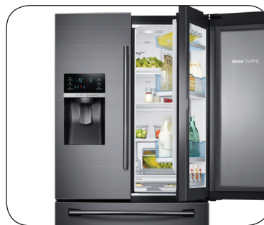
Food Showcase Fridge Door

Fingerprint Resistant Black Stainless Steel