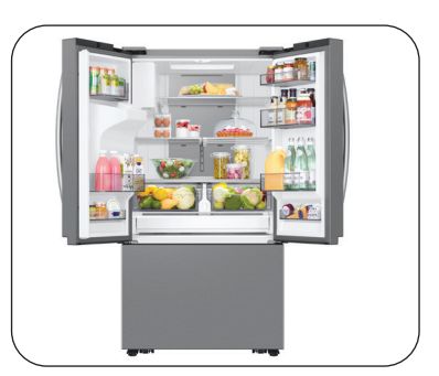
Large 25 cu. ft. Capacity