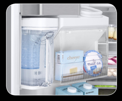
Auto fill water pitcher with Infuser