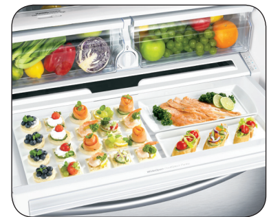
Automatic Filtered Ice Maker in Freezer (External Filter Not Included)