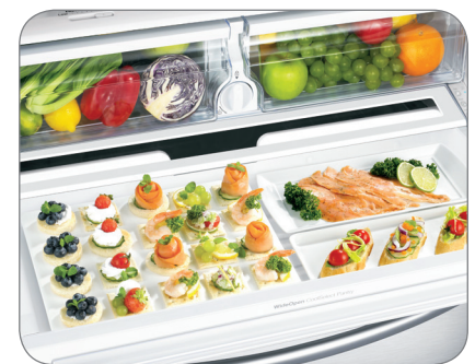
CoolSelect Pantry™ with Temperature Control