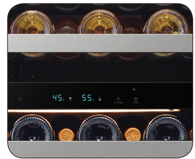
Dual Temperature Zone