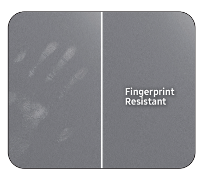
Fingerprint Resistant Finish