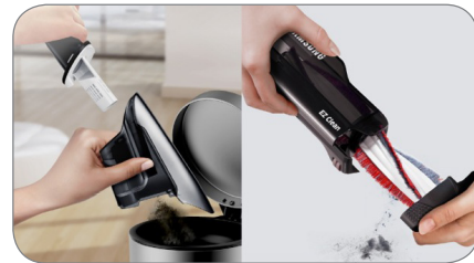
EasyClean Dust Bin and Brush