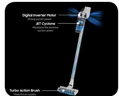
Advanced Cleaning Performance (150 Air Watts)