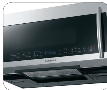
One-Touch Simple Clean Filter

Fingerprint Resistant Stainless Steel (shown)