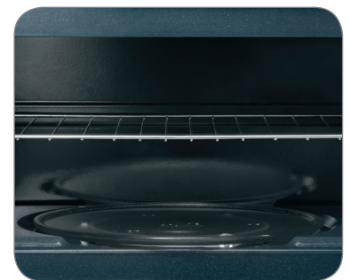
Ceramic Enamel Interior