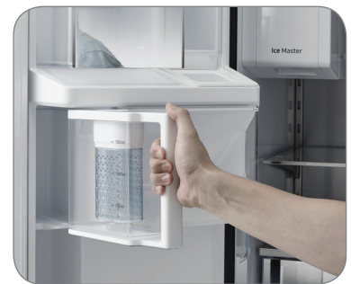
Auto Fill Water Pitcher