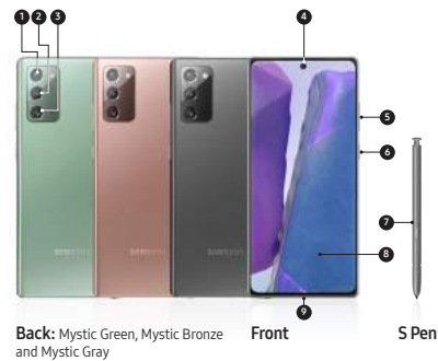
Galaxy Note20 5G