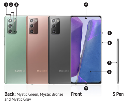
Galaxy Note20 5G