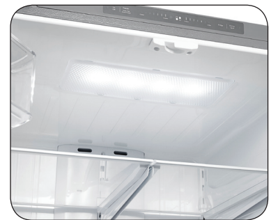
High-Efficiency LED Lighting