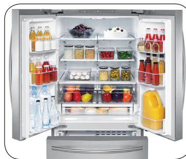
French Door Design