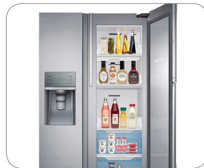
Food ShowCase Fridge Door